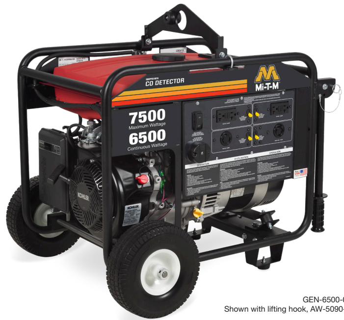
GEN-6500-0MK1 Shown with lifting hook, AW-5090-0003

Engineered for tough jobs, these 7500 to 8000-watt generators deliver reliable power with durable construction and essential safety features.